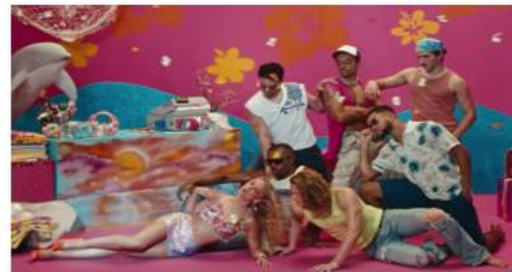
State Side Music Video